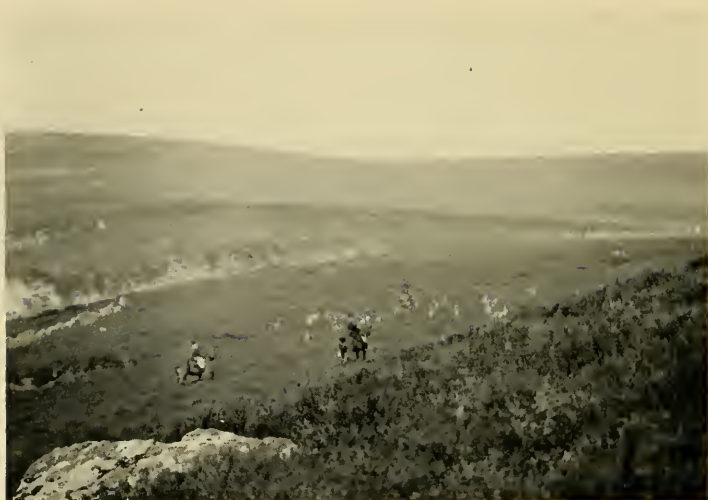
DRAWING ON DARTMOOR